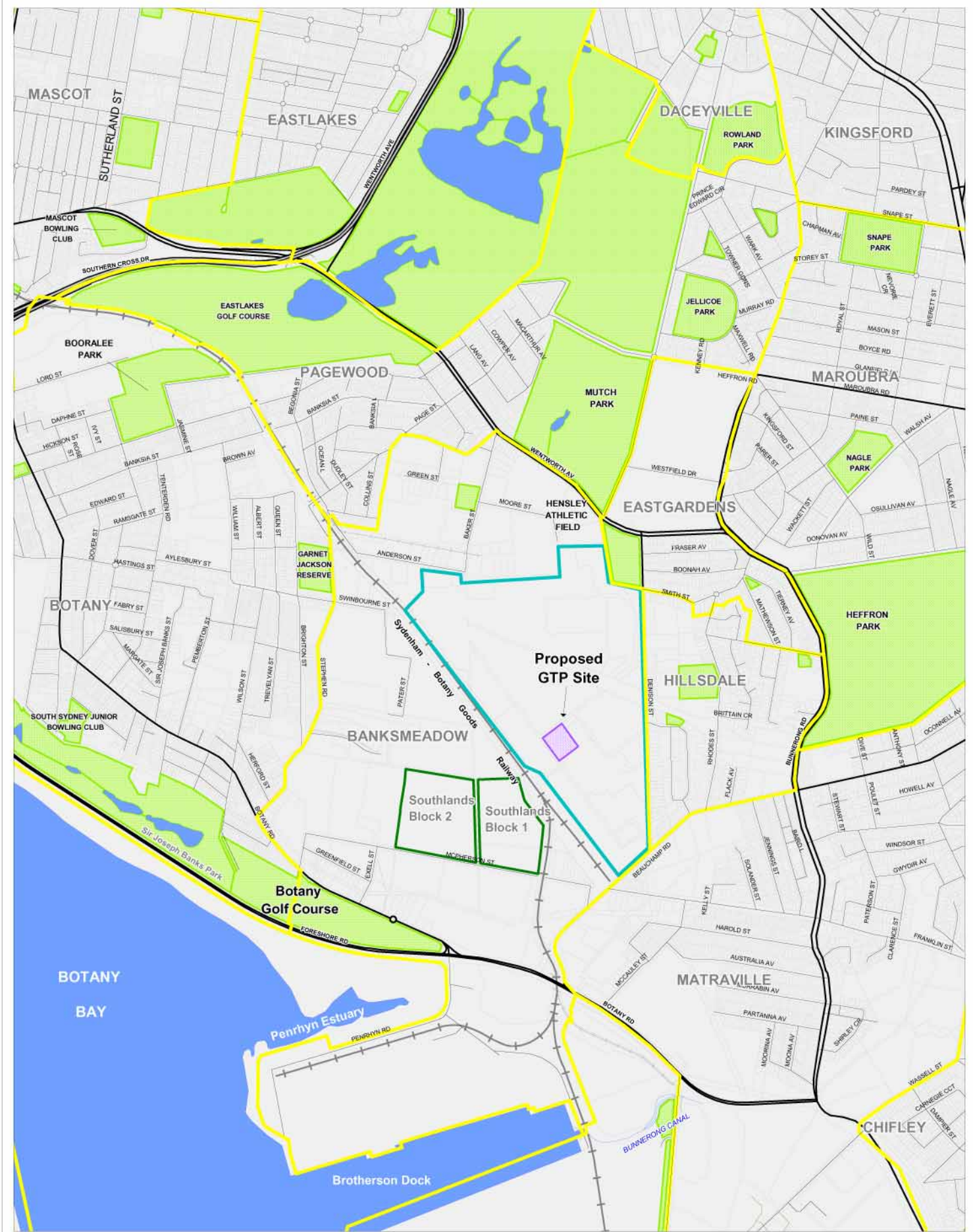
FIGURE 1-2 BGC Project Location & Surrounds