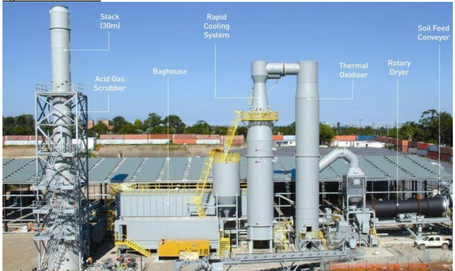
Figure 2: The DTD Plant

The gas stream is then transported from the cyclone to the thermal oxidiser. Heating the vapour to around 1000°C converts it by combustion into an off-gas that is comprised mainly of nitrogen oxides, carbon dioxide, water and hydrogen chloride (hydrochloric acid) i.e. combustion thermally destroys the volatilised organic compound contaminants. The thermal oxidiser would be similar to that used in the Groundwater Treatment Plant at Botany, although not as large.