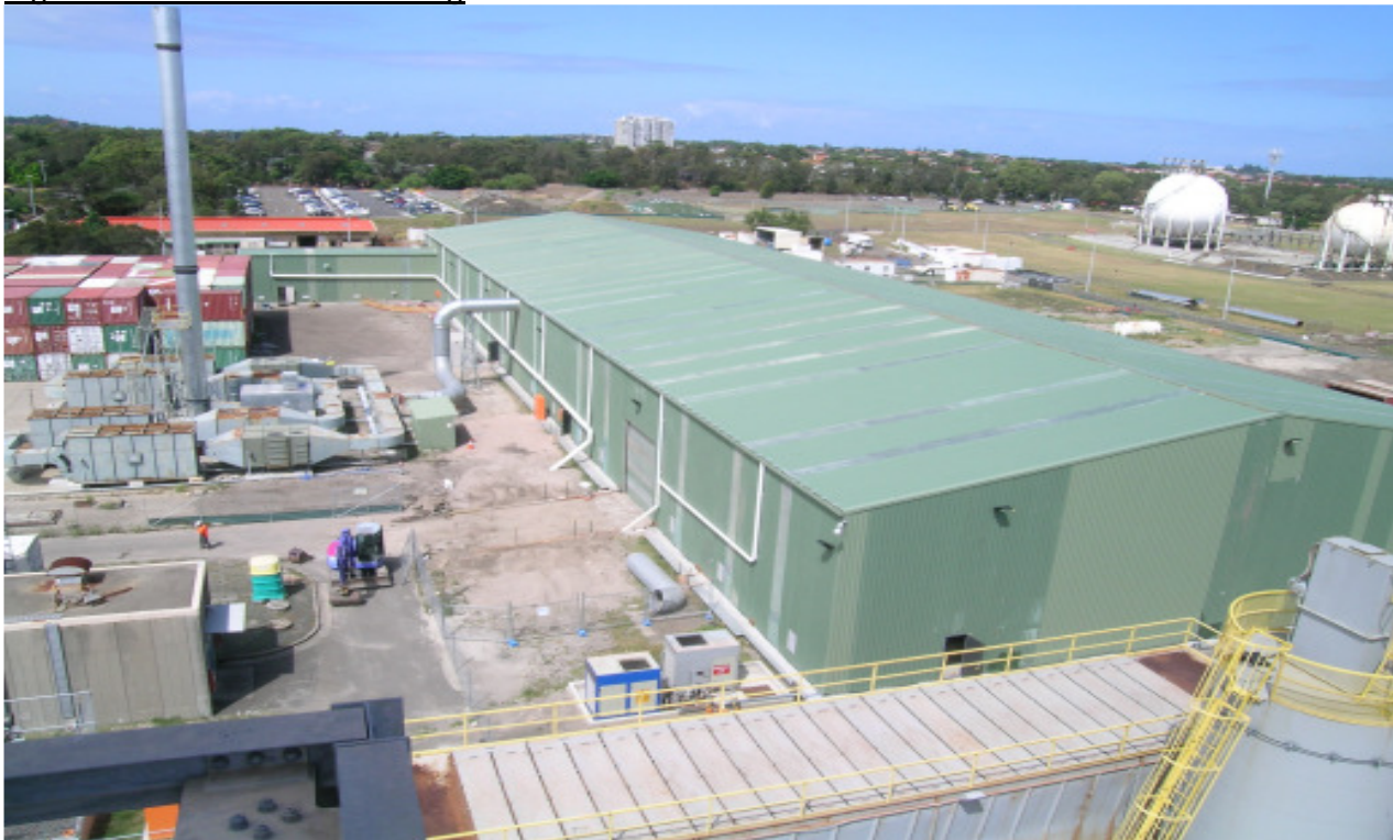
Figure 1: The Feed Soil Building

The contaminated soil is being excavated within a sealed building constructed over the CPWE (Excavation Soil Building, ESB) to prevent dust being released into the atmosphere. Some soil sampling occurs in the ESB to test for the expected contaminants. Covered trucks transport the excavated soil on an internal Botany Industrial Park road to the Feed Soil Building (FSB) where it is screened to break down clumps and remove debris. The soil is stockpiled and tested further to confirm its contaminant concentrations before being fed by a conveyor into the adjacent DTD plant for treatment. To control emissions of dust and odour, the Excavation and Feed Soil Buildings are each fitted with an emission control system (ECS).